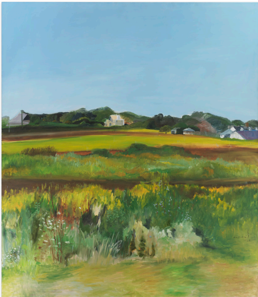
Jane Freilicher, Late Summer , 1968, Oil on canvas, 80 x 70 inches, 203.2 x 177.8 cm