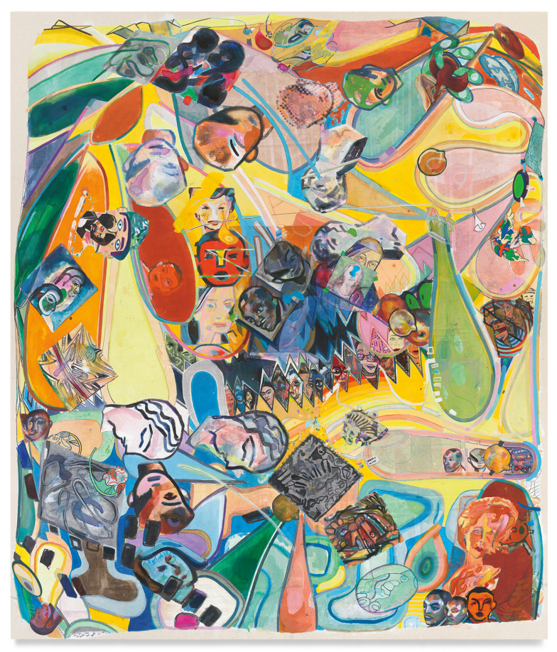
Franklin Evans, decenteringfacespace, 2021, Acrylic on canvas, 80 5/8 x 68 5/8 inches, 204.8 x 174.3 cm

At times, these snippets offered little more than the middle-brow pleasure of winning a namethat-tune contest. At other times, "high" modernism became a measuring stick for gauging the historical specificity of feeling human. For instance, Evans's representation of his own work space, titianatilt, calls out for comparison with Matisse's Red Studio, 1911. Both scenes are populated with nods to other Matisse paintings, but whereas the nested images in The Red Studio afford the eye moments of rest before it resumes its ambit over the canvas's rusted-red expanse, titianatilt shows a pile of printed-out JPGs on a candy-striped floor so densely packed with visual stimulations that gaining one's bearings is nearly impossible. The interior becomes a vivid portrait of an information-addled twenty-first-century mind.