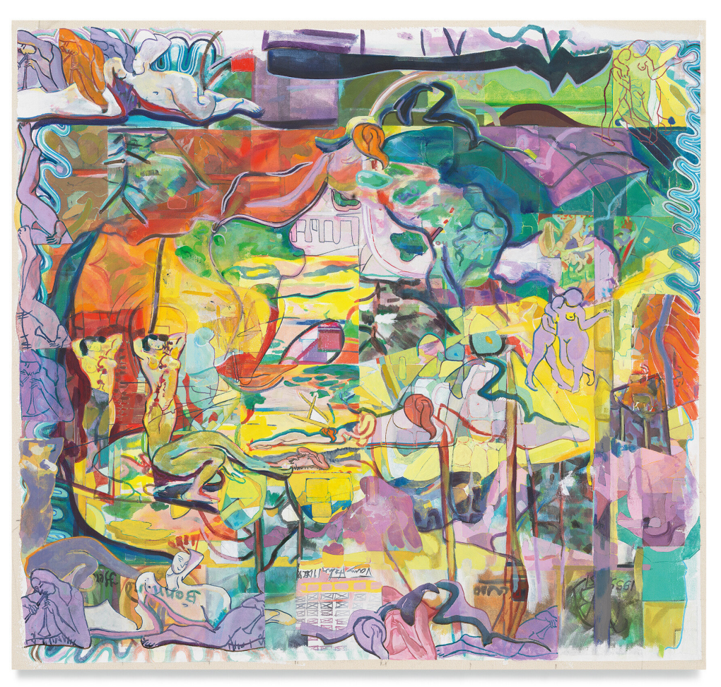
Franklin Evans, joysdivision, 2021, Acrylic on canvas, 30 3/4 \times 32 5/8 inches, 78.1 \times 82.9 cm

The titles for the paintings in Franklin Evans's exhibition "fugitivemisreadings" were made up of lowercase letters jammed together into solid blocks, like the stream-of-consciousness "thunder-words" in James Joyce's Finnegan's Wake (1939), or the file names of PDFs scattered over a Mac desktop. In one canvas, Evans paid tribute to Henri Matisse's famous pastoral of 1905—1906, The Joy of Life, by hand copying the composition's Fauvist figures and rearranging them as if he were using the cut-and-paste function in Photoshop. The work is called ... wait for it ... joysdivision (all works cited, 2021). Yes, the name of this Matisse remix is a callback to everyone's favorite short-lived New Wave postpunk act from Salford, England. Why so? Was the pun just irresistible?