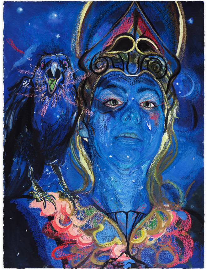
Raven III , 2022, Gouache and chalk pastel on paper, 30 x 22 in.

Eagled-eyed viewers can also spot Frank’s drawings and notebooks in The Crowded Room , a new Apple+ miniseries. Tom Holland, the show’s star, plays a New York artist in 1979 who is arrested for a shocking crime—one he swears he didn’t commit.