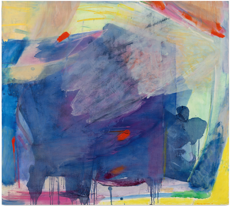
The Thunder Hurried Slow , 1978, Oil on canvas, 54 x 54 inches, 137.2 x 137.2 cm