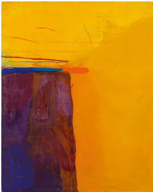
Hear the Wind Blow , 1972, Oil on canvas, 50 x 40 inches, 127 x 101.6 cm It is one of the more geometric works included in the new exhibition.