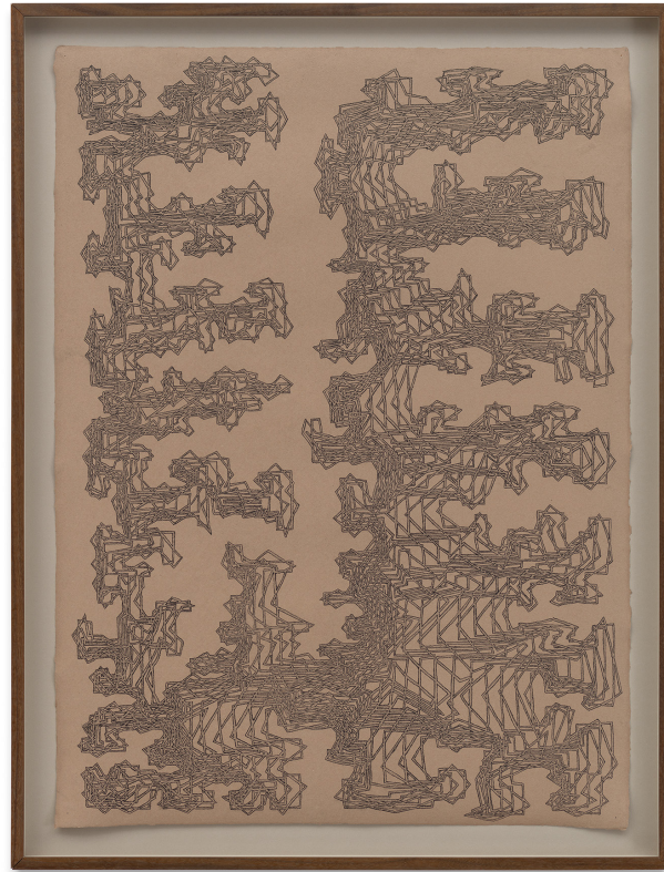
James Siena, TLIL4TH7 , 2019. Graphite and charcoal on paper, 31 x 22 3/4 inches.

In this exhibition, we are shown again and again the fact that Siena's change of skin is a renewal, and a reaffirmation of his key role in our artistic lives.