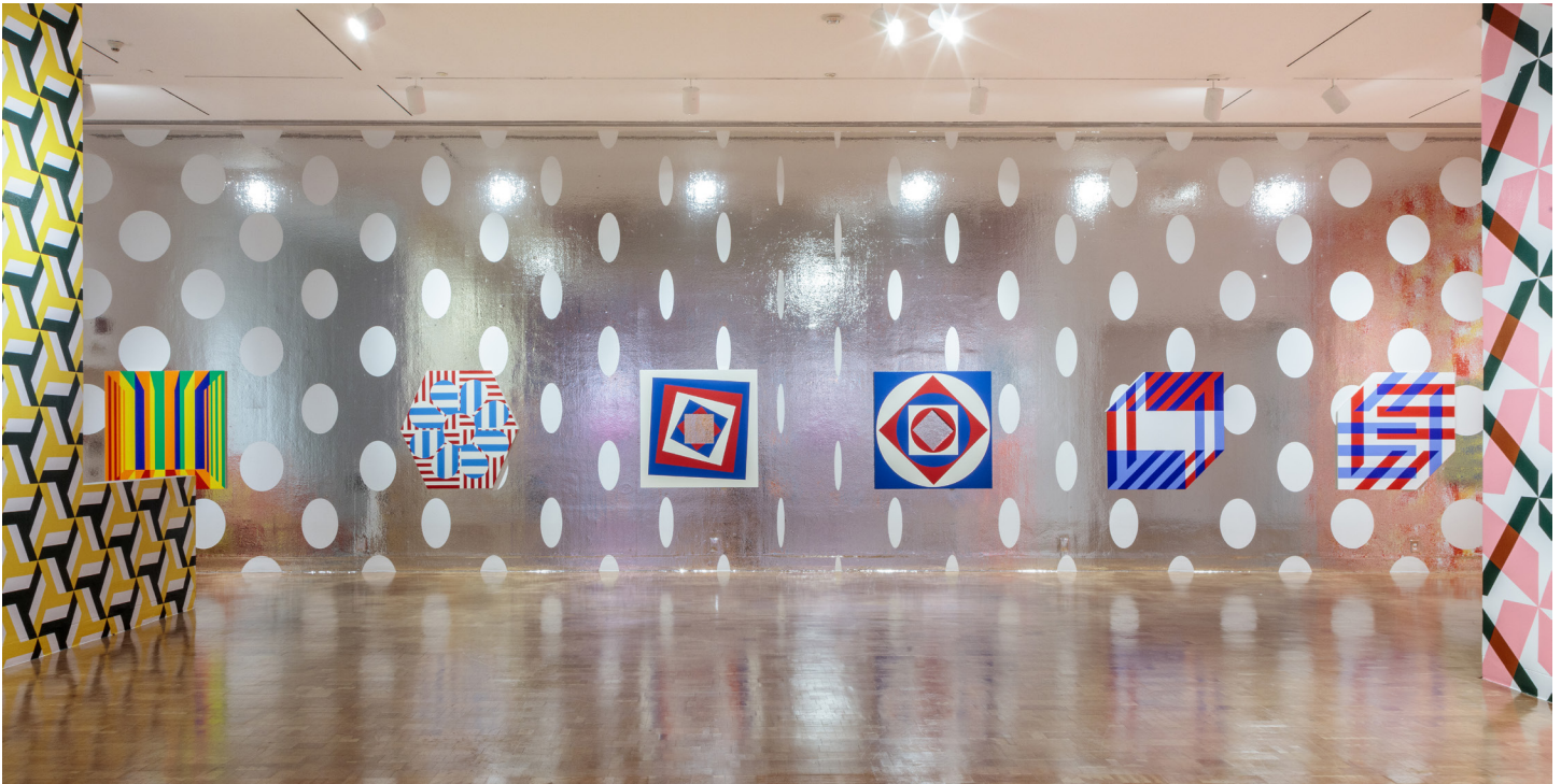
Installation view, Jim Isermann: Wrapture , Pacific Design Center Design Gallery, Los Angeles.

Primary colors and simple geometric shapes in different configurations can create complex patterns and dizzying experiences as exemplified by Wrapture , a spectacular installation by Jim Isermann at the Pacific Design Center Gallery. Isermann has been creating and exhibiting colorful, hard-edge geometric works on paper and canvas for years. He also uses vinyl to create shapes that can be tiled to span large walls and become installations. When the paintings and vinyl decals come together, the whole becomes much greater than the parts, especially when the walls and the architecture of the space are integral aspects of the installations. Isermann's work has connections to Op Art, as he is interested in the optical effects between forms and colors, however it goes beyond the formal to resonate on multiple levels. He brings together exacting precision and mathematical computation, craft, decoration, pattern, geometry and color theory to look at the relationship between high and low, intermixed with Queer identity and camp aesthetics.