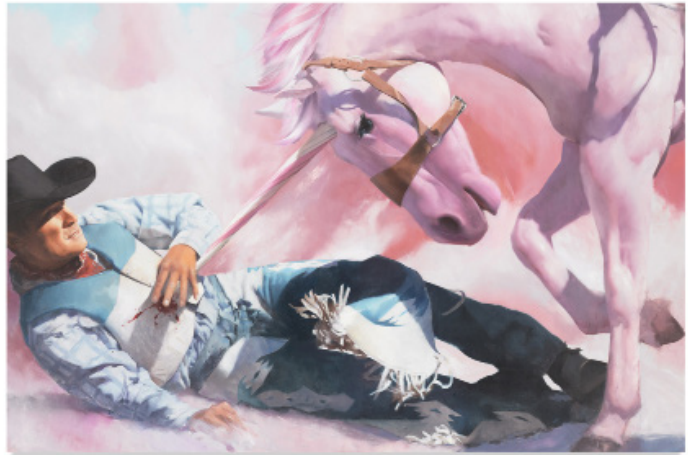
Will Cotton, The Taming of the Cowboy , 2020, Oil on linen, 52 x 78 inches, 132.1 x 198.1 cm

NEW YORK - MILES McENERY GALLERY is pleased to announce the group exhibition Really. that will open on 15 October at 511 West 22nd Street and remain on view through 14 November 2020. The exhibition is curated by Inka Essenhigh and Ryan McGinness and is accompanied by a fully illustrated digital publication featuring a text by Kurt McVey.