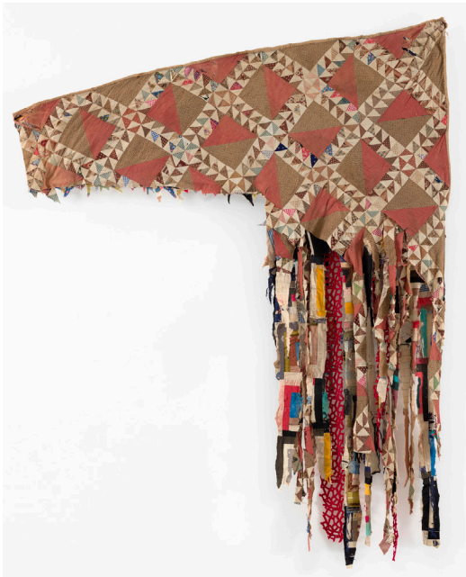
Sanford Biggers, The Charlatan , 2020. Antique quilt, assorted textiles, 73 x 67 1/2 x 3 inches, 185.4 x 171.5 x 7.6 cm